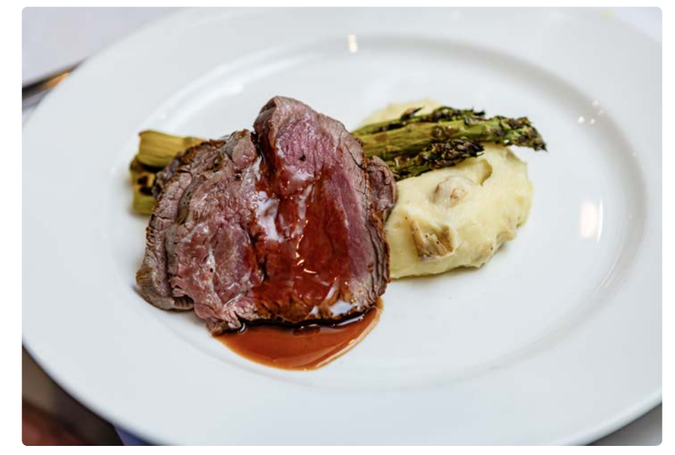
Hall's Chophouse place setting