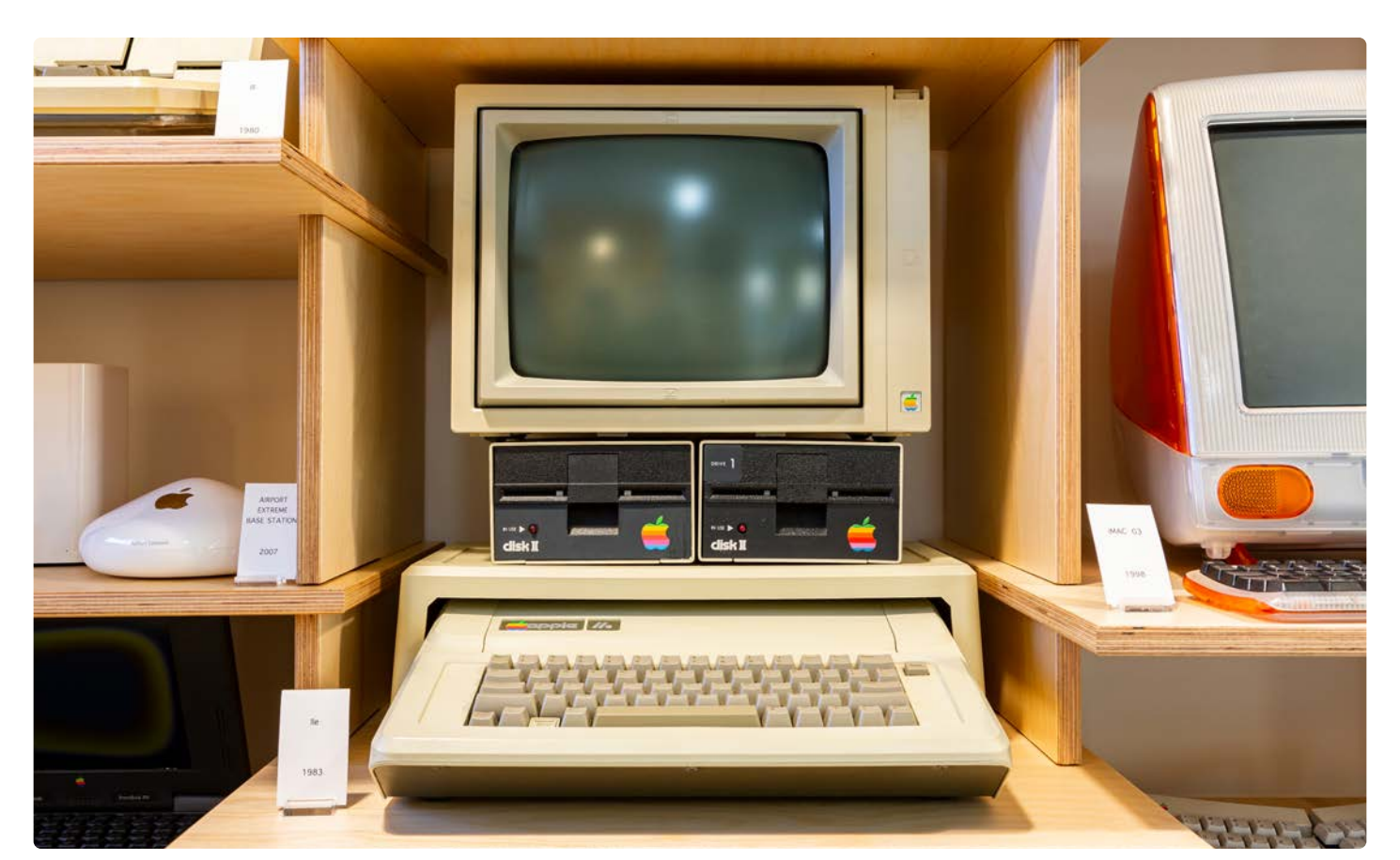
An Apple IIe model from 1983