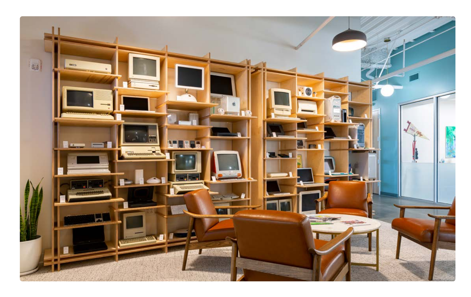
Charleston Apple Museum at Flagship