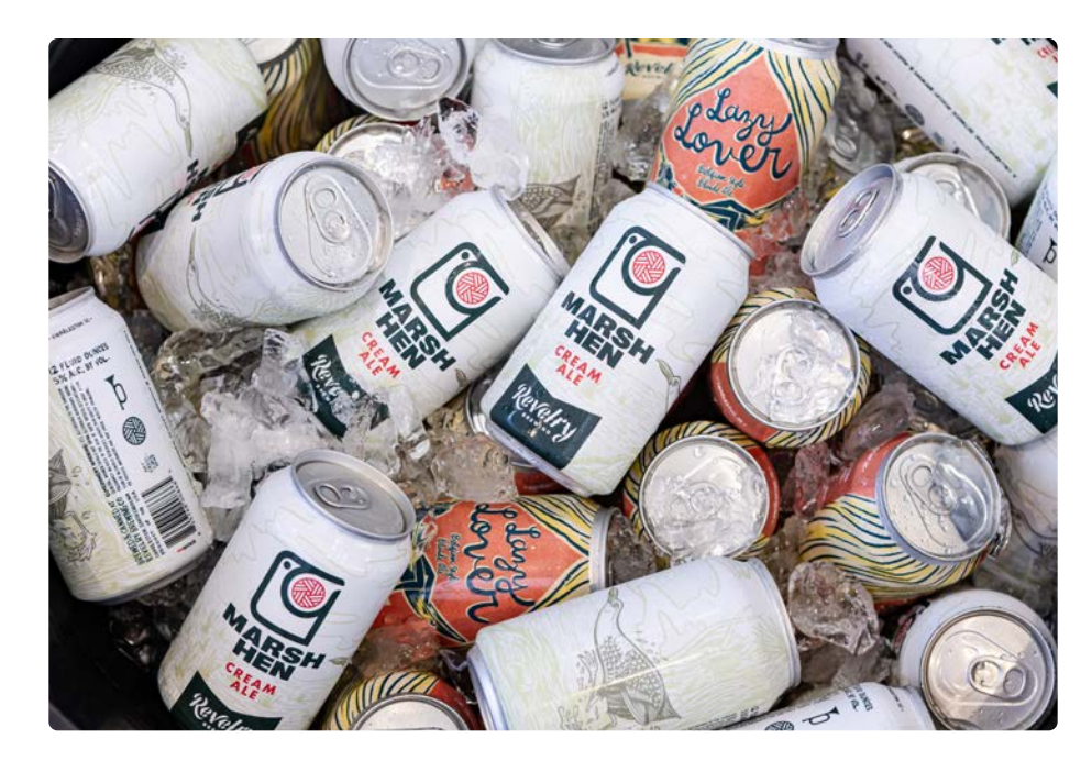
Local beers from Revelry Brewing