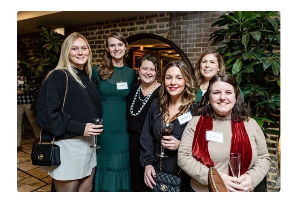
Omatic company group